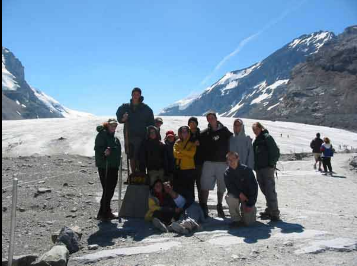
My students on the summer 2002 field trip on Athabasca glacier. The sign shows where the glacier was in 1992.