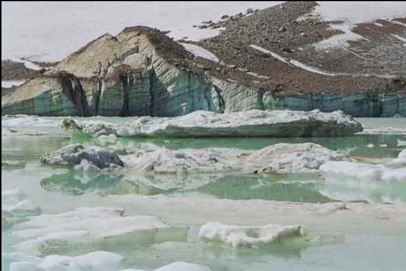
Another photo of Angel Glacier